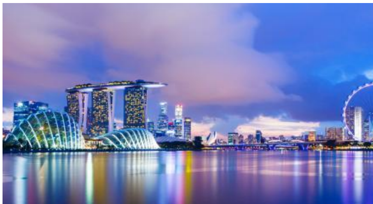
2020 Asia Conference April 22-24, 2020 Singapore