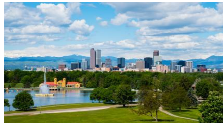
2020 World Technology Law Conference May 20-22, 2020 Denver, United States