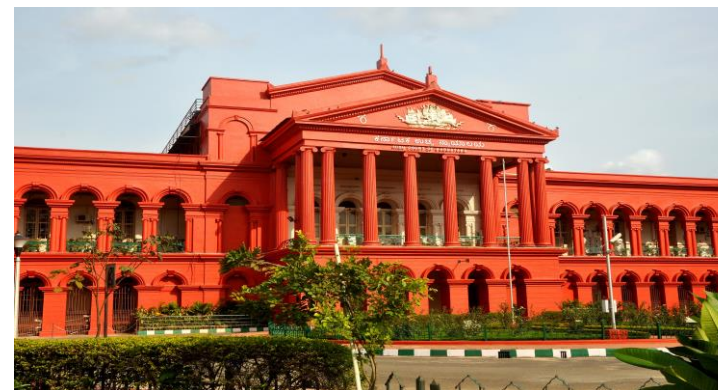
2020 International Asia Conference January 29-31 or February 5-7, 2020 Bangalore, India