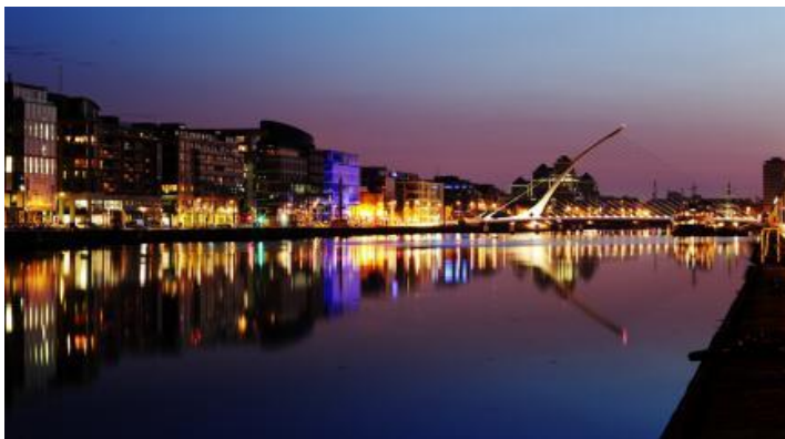
2019 European Conference October 30 – November 1, 2019 Dublin, Ireland